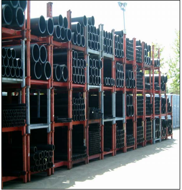
(16 Bar HDPE Fire Mains: AGIP KCO)